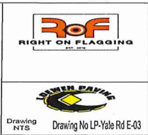
Figure # 7.8 in the TCMWR 2015 Edition Single Lane Alternating This Traffic Control Plan is designed to accommodate patch work at 46392 Yale Rd There are 3 patches at this location Work to commence Thursday, Aug. 16th, 2018 and is expected to be completed in one day, however permit will be requested for a week Work hours shall be from 7:00 am - 5:00 pm All signs and traffic devices shall be placed in compliance with WCB and the TCMWR